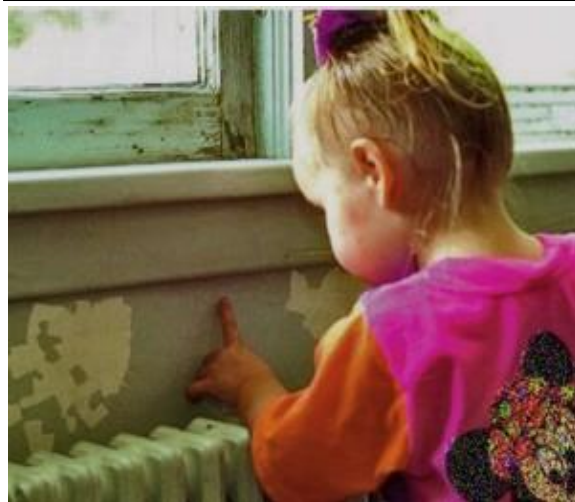
Lead-based paint is still present in many homes in Hawai'i. Children are at risk from eating paint chips and flakes. The paint chips can also fall off the house exterior and get in the soil adjacent to the foundation where children may play.

Lead was added to paint as early as the Medieval ages to speed up drying and increase durability. The use of lead in house paint was banned by 1978 but it still exists in the interior and/or exterior paint of many older homes in Hawai'i. As a result, real estate sales must disclose the potential presence of lead based paint on buildings built before 1978. As the paint chips off, it falls to the ground where the lead-contaminated chips persist in the soil near the foundation. In addition, some older type roofing nails contain lead. Roofing nails have wide, flat heads and short shanks. Similar to the paint chips, as the roofing nails fall off and land adjacent to the foundation, lead can be leached from the nails and mix with soil.