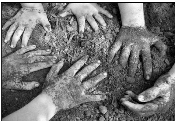
Children are at risk of lead exposure from unintentional ingestion of soil through normal play activities.

Ingesting the soil is the primary source of exposure to lead in soil. Lead can also be inhaled with very fine soil particles during outdoor tasks (e.g. dust from yard work or construction work) or carried into houses as airborne dust, or on shoes, clothing, and pets where it gets on floors or other objects that residents then come in contact with.