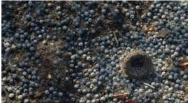
Lead shot at a firing range. There are several sources of human-caused lead contamination that affect Hawai'i's soil and groundwater.

Lead is a naturally occurring element that occurs in all soils, including Hawaiian soils, at low levels. Natural background levels of lead in soils are typically 10 to 75 mg/kg (milligrams of lead per kilogram of soil) but elevations in the range of 100-200 mg/kg, levels still considered below a significant long-term health hazard risk, can be found in isolated cases due to additional inputs from historic human activity. Higher lead levels in soils (e.g. >200 mg/kg) may be present from a variety of pollution sources related to historic or current human activities. Exposure to very high levels of lead can be toxic to humans and animals, causing serious health effects. Most childhood exposures to lead can be traced to lead-based paint or lead in batteries, jewelry, and other household items. Exposure to lead in soil can also be important, however.